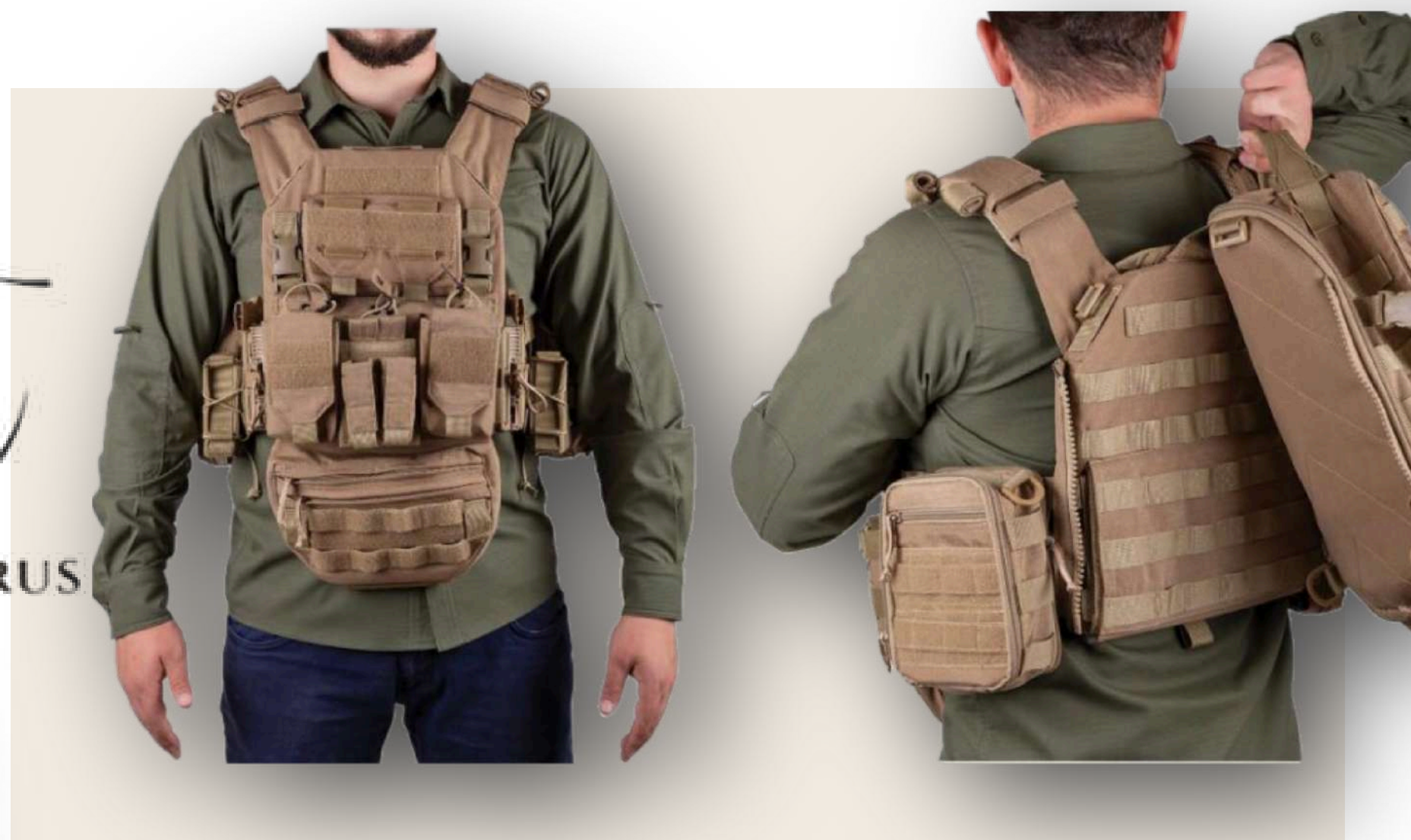
Plate carrier vests are not actually ballistic features on their own, but provide ballistic protection according to the ballistic level of the plate they carry. If the plate is not used, it can also be used as an ammunition and tactical equipment carrier. Thanks to their lightness, they provide an operationally superior level of activity.