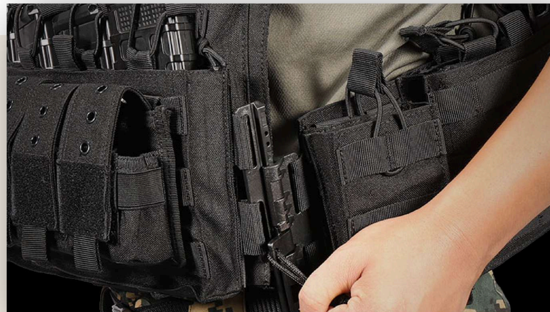
Plate carrier vests are not actually ballistic features on their own, but provide ballistic protection according to the ballistic level of the plate they carry. If the plate is not used, it can also be used as an ammunition and tactical equipment carrier. Thanks to their lightness, they provide an operationally superior level of activity.