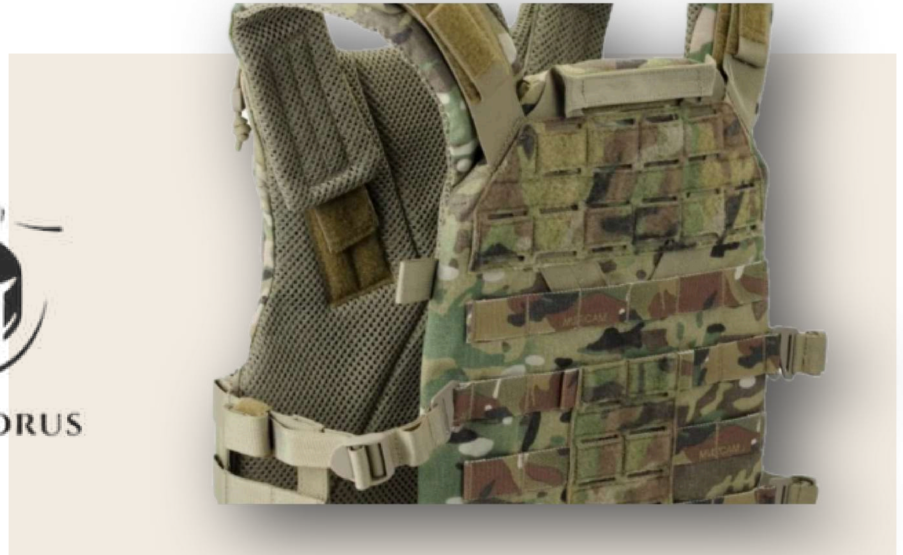
Plate carrier vests are not actually ballistic features on their own, but provide ballistic protection according to the ballistic level of the plate they carry. If the plate is not used, it can also be used as an ammunition and tactical equipment carrier. Thanks to their lightness, they provide an operationally superior level of activity.