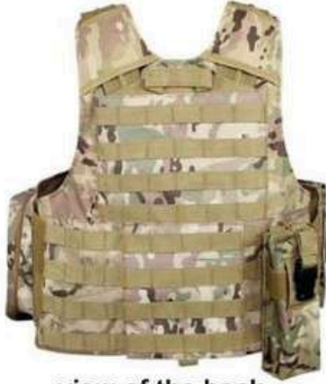
view of the back of the offensive vest